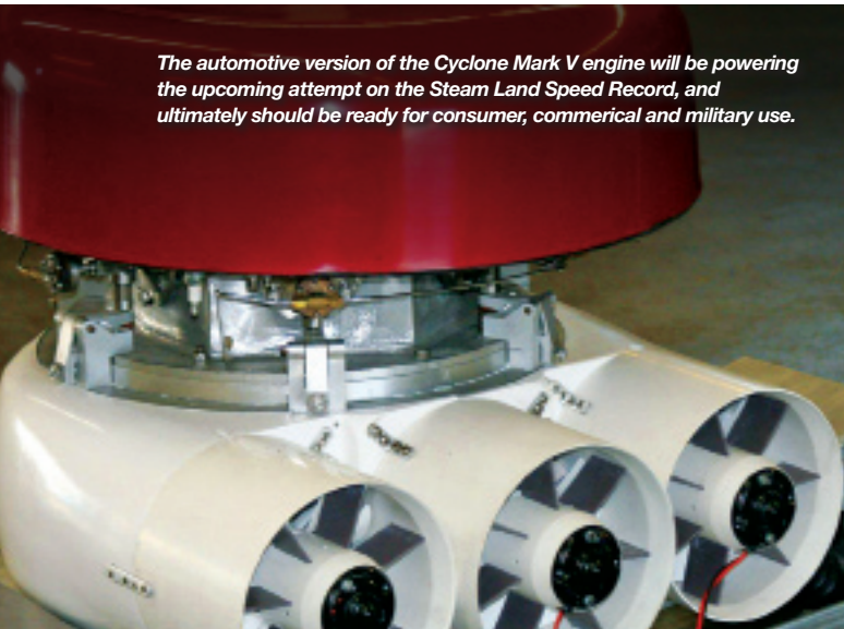
The automotive version of the Cyclone Mark V engine will be powering the upcoming attempt on the Steam Land Speed Record, and ultimately should be ready for consumer, commercial and military use.

His hope is that the modern Cyclone steam engine could one day help wean the U.S. off foreign oil—perhaps even domestic